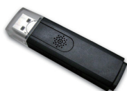
Wireless-G USB Adapter Included!

Supports WLAN operation with Wireless-G USB Adapter